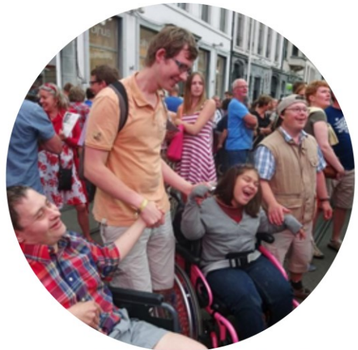
Going to a festival TOGETHER